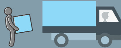
Landed delivery into distribution centers