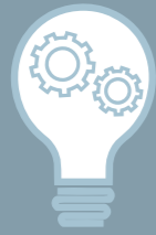
Product Design & Development

Control over the full supply chain makes Rudra Cottex a reliable total service provider of a vast array of value-added yarn products to meet the unique and ever-changing needs of its customers.